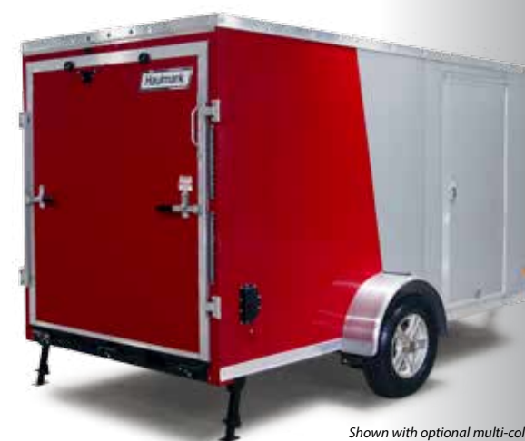
Shown with optional multi-color exterior.